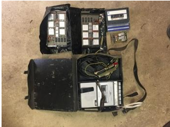
Unidentified CE Tool