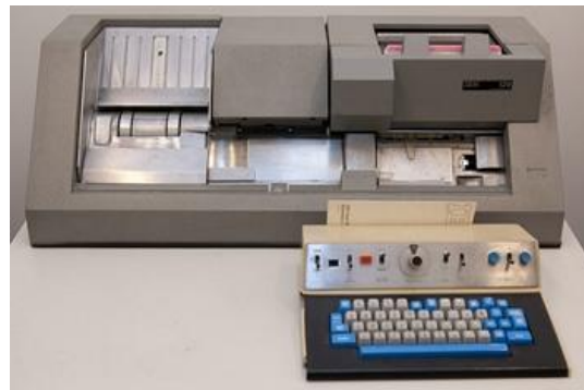
129 Buffered Card Punch / Verifier