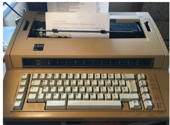
6715 Daisy Wheel Typewriter