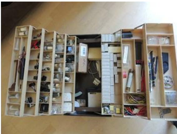
CE Parts Box